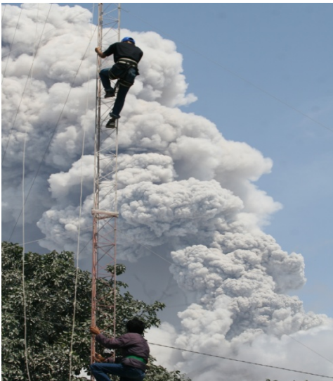
Two observers from CVGHM climb a radio mast to service antennas used to receive seismic data during the October–November 2010 eruptions of Indonesia’s Mt. Merapi volcano.

Following the 1985 eruption of Nevado del Ruiz Volcano in Colombia, which resulted in an estimated 23,000 deaths, USAID/OFDA and the U.S. Geological Survey (USGS) established the Volcano Disaster Assistance Program (VDAP)—the world’s only international volcano crisis response team. Since 1985, USAID/OFDA has provided nearly $28 million to support VDAP, including more than $3.5 million in FY 2014. To date, VDAP has responded to 27 major crises and helped to build response capacity in 12 countries. VDAP scientific teams travel to restless volcanoes throughout the world at the request of host governments and, using volcano-monitoring equipment, work with counterparts to quickly assess hazards and generate eruption forecasts. In FY 2014, VDAP and the Government of Indonesia’s Center for Volcanology and Geological Hazard Mitigation (CVGHM) monitored repeated eruptive activity from Mt. Sinabung prior to its February 1 eruption, following continuous volcanic activity since September 13, 2013 in Indonesia’s North Sumatra Province. VDAP provided four monitoring stations, interpreted satellite imagery and seismic data, and deployed a team of three USGS volcanologists to Indonesia to collaborate with CVGHM. For more information about VDAP: