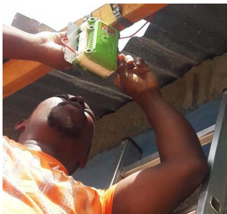
Sensors, like the one being installed at this borehole well site in Afar, Ethiopia, are helping provide key water data to address critical water supply challenges.

http://www.worldbank.org/en/news/feature/2017/05/02/moving-away-from-humanitarian-appeals-to-managing-droughts-in-ethiopia