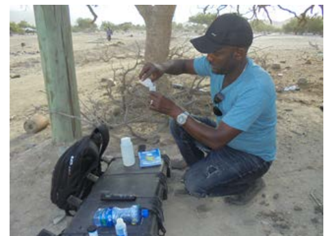
Testing the well water for pH, TDS and EC to check on level of service improvements

USAID Lowland WASH's technical capacity building program entails hands-on/field and classroom training. To date, over 100 staff from the RWB and nearly all the WWOs have participated in sensor installation and troubleshooting, asset management, tools application, platform customization and data analysis. Asset management training incorporates inventory assessment and O&M for motorized borehole components such as solar powered water systems and diesel generators. Institutional capacity building includes development of asset management procedures, budget analysis, and financial planning. The Activity is deploying training and direct consultations to assist designated RWB and WWO personnel to establish procedures and work flows to collect and analyze field data, and deliver preventive maintenance. To assist with financial planning and budget analysis, USAID Lowland WASH in collaboration with USAID SWS-LP, has introduced the lifecycle cost analysis (LCCA) concept for motorized and