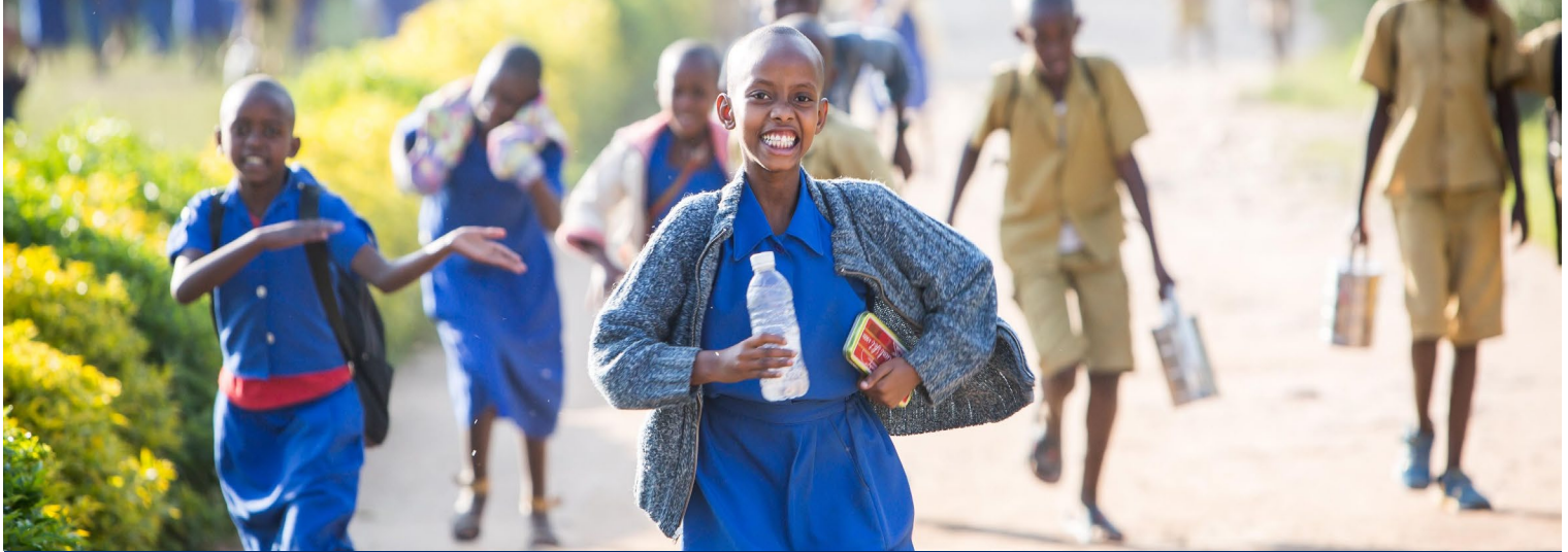
Children from one of the USAID supported schools run home after school