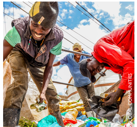
Worker-Owners of Kigro Recyclers Worker Cooperative, established by youth entrepreneurs as a waste collection enterprise in Nairobi, Kenya, sort through collected waste to recycle for cash.