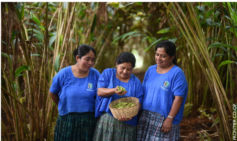
In Cobán, Guatemala, farmers from the Federation of Cooperatives of las Verapaces smile as they hold a basket of freshly harvested cardamom pods.

With the goal of advancing sustainable and inclusive development globally, CDP invests in cooperatives to build social cohesion, stabilize economies, and support local communities. The program currently works across multiple sectors throughout Africa, Asia, and Latin America.