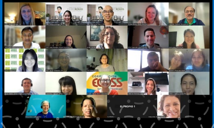
GERRY ROXAS FOUNDATION. A screenshot of members from around the world during the first virtual COPE gathering.