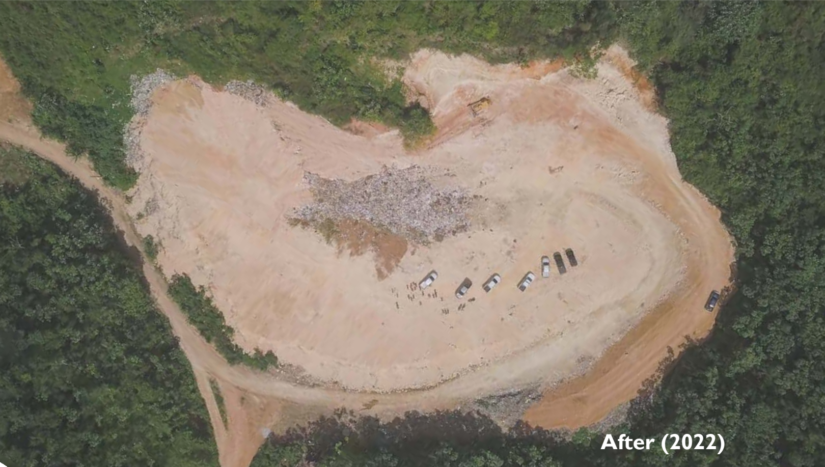
Aerial views of before and after USAID-supported remediation of the Las Terrenas dumpsite in the Dominican Republic.