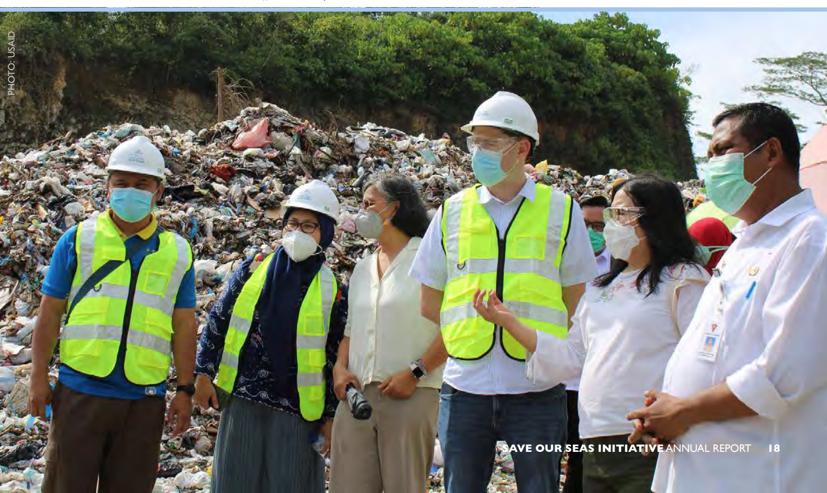
USAID Clean Cities, Blue Ocean staff visit a dumpsite in Indonesia

local individuals have already collaborated on SCILs, increasing their capacity to plan, build, and operate effective solid waste management systems