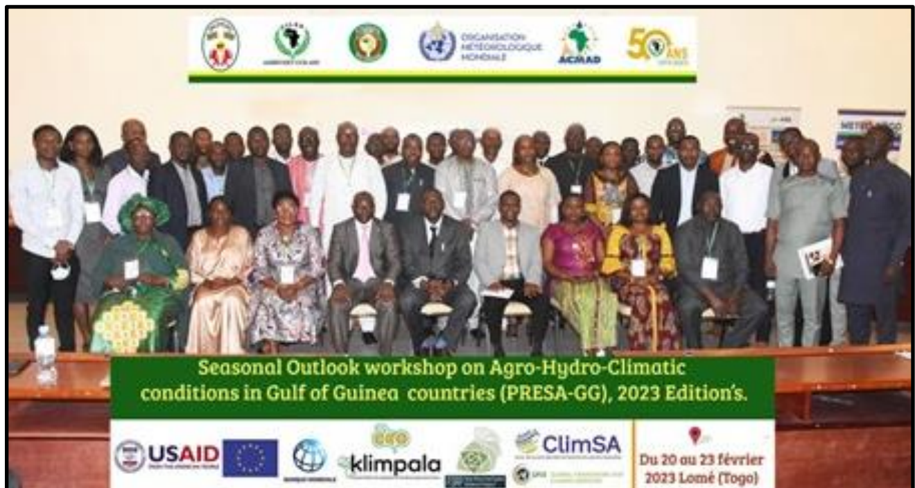
Group photograph of the participants at the Workshop.

Lome, Togo, 20 to 24 February 2023: With the financial support of USAID, the European Union through the ClimSa project, and the West Africa Food Security Program (FSRP), the Regional Climate Center for West Africa and the Sahel (RCC-WSA), in collaboration with its partners has organized a workshop on seasonal forecasting of the agro-hydro-climatic characteristics of the main rainy season for the Gulf of Guinea countries, followed by a forum for sharing with the users of these products and information developed.