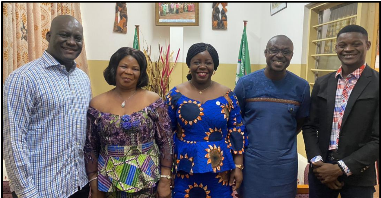
Representatives from the Ghana National Registered Nurses and Midwives Association after an interview with the HSDF team.

The USAID-funded Connect and Learn for Sustainable Associations (CLOSA) project is making significant progress towards helping private sector associations (PSAs) operating in West Africa attain commercial viability and financial sustainability.