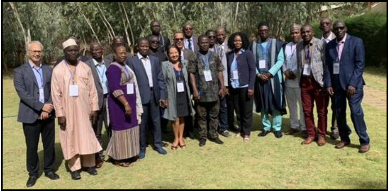
Group photograph of participants at the workshop.

Saly Portudal, Senegal February 21 to 24, 2023: The Permanent Interstate Committee for Drought Control in the Sahel (CILSS), with technical assistance from the International Union for Conservation of Nature (IUCN) and financial support from USAID, has organized a regional workshop as an initiative to strengthen the capacities of the Permanent Secretaries of the CILSS National Committees (SP CONACILSS) of the thirteen member countries on Nature-Based Solutions (NBS).