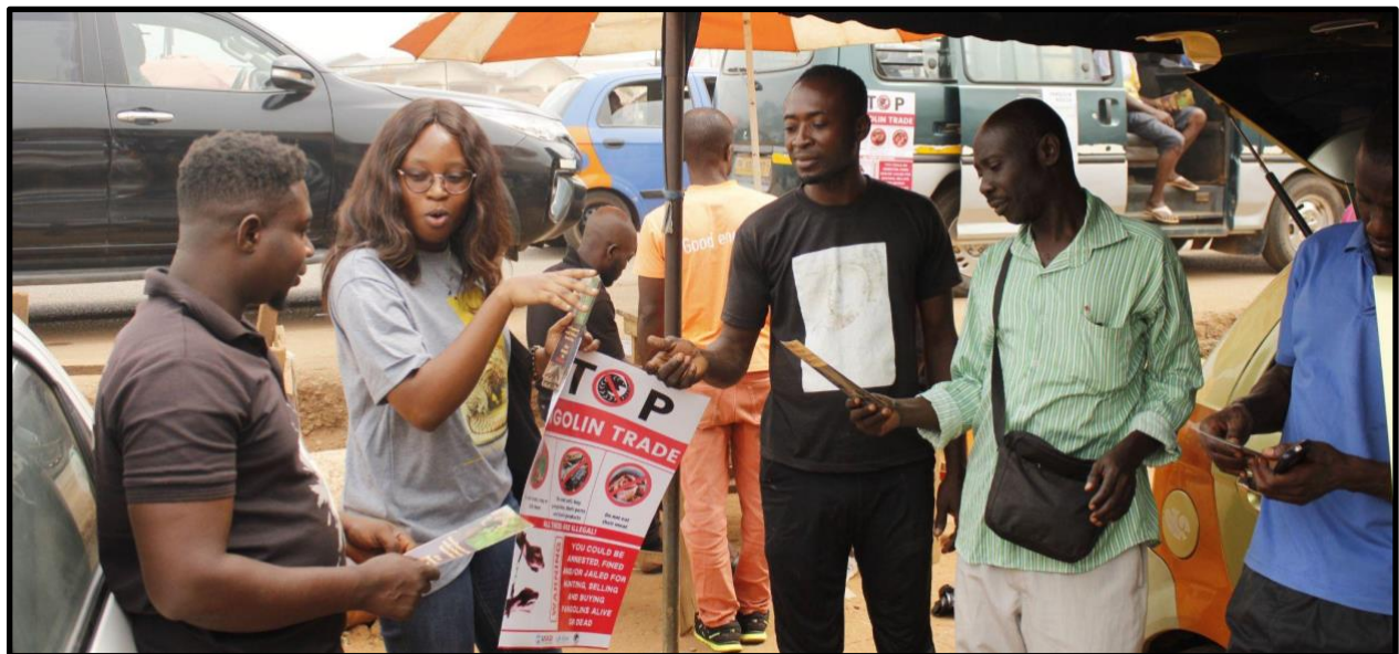
The WABiLED team interacting with some drivers on World Pangolin Day.

Accra, Ghana, February 18, 2023: The West Africa Biodiversity and Low Emissions Development (WABiLED) celebrated World Pangolin Day to raise awareness about pangolin conservation and the threat these native wild animals face. All eight species of pangolins are