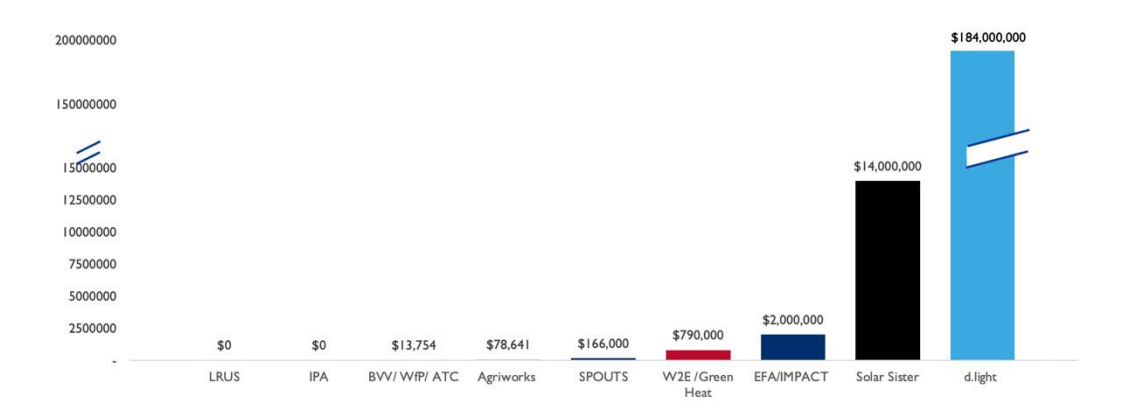
Figure 2 Follow-on Funding Raised Disaggregated by Grantee