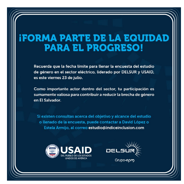
Above: Engendering Industries partner DELSUR "Be a Part of Equity for Progress!" Campaign

Targeted communications, such as pre-survey trainings or orientations, build trust among participants and increase the accuracy of results. Pre-survey information sessions orient respondents to the survey's purpose, enhance their understanding of the topic, and ensure their comfort level with the survey method. Leaders should strategically use communication to generate interest and motivate participation. Survey teams should design and communicate the survey with employees to make them feel safe about answering questions honestly, without fear of backlash, especially on more sensitive topics such as discrimination or sexual harassment.