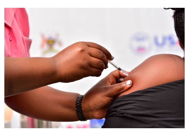
A HEALTH WORKER ADMINISTERING A VACCINE IN KAMPALA.

In July 2021, the USG stood up an interagency Incident Management Team that included USAID and