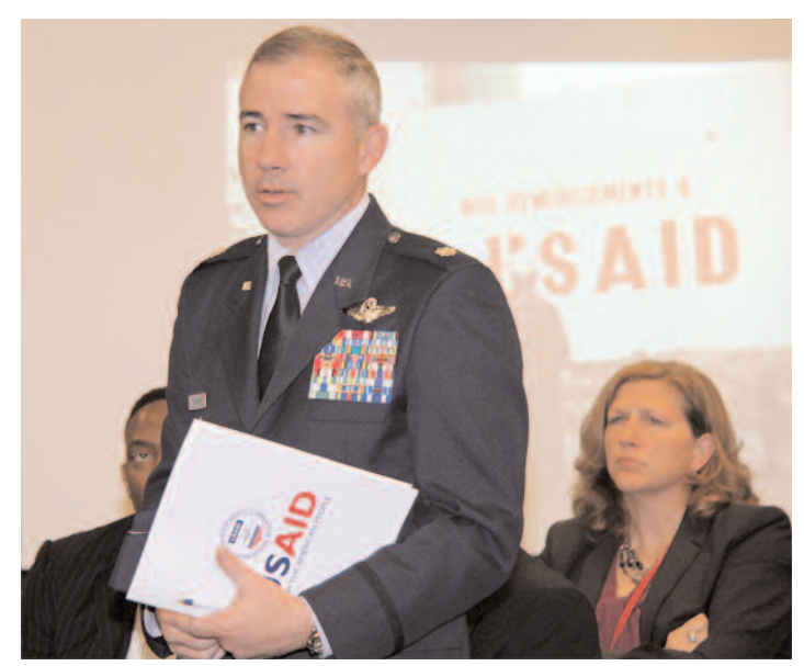
A U.S. Air Force student from the National War College asks a question at a USAID briefing in Washington, D.C., January 11, 2013. USAID sends students and faculty to several U.S. military schools and institutions each year, and routinely hosts briefings for members of the military to ensure transparency and mutual understanding.

USAID is the lead development agency of the U.S. Government (USG). The Agency offers a comparative advantage through its field presence and pool of skilled, experienced professionals. USAID contributes to national security objectives by addressing global challenges such as extreme poverty, food insecurity, poor governance, infectious disease, water scarcity, and climate change through strategic, sustained, and long-term development programs. When USAID succeeds in helping other countries address these challenges, the Agency may reduce security risks by preventing them from becoming crises and conflicts.