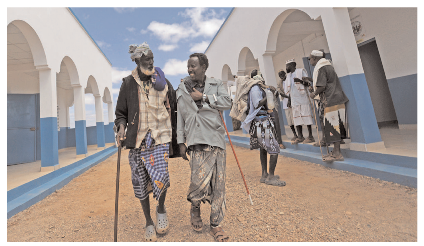
Residents of the Ali Sabieh District in Djibouti visit the new Guistir Clinic during the facility dedication event, February 2011. The $450,000 project was the direct result of efforts between USAID, the Djibouti Ministry of Health, and Combined Joint Task Force - Horn of Africa (CJTF-HOA), and provides health care for 400 families. Planning and coordination for the clinic was streamlined due to improved interagency coordination, more specific civil-military guidance, and USAID's inclusive leadership of development.

It is USAID policy for its personnel to cooperate with DoD in order to support the Agency's mission and advance its objectives. USAID will invest its cooperative efforts in areas with the greatest potential for positive results.