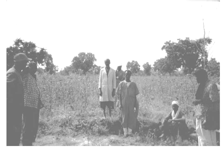
Farmers in Mali demonstrate the benefits of community natural resource planning. This field was eroded and virtually useless, but community efforts at building and implementing erosion control measures helped restore the field's fertility.

The community, together with the donor and NGO partners, works with technical staff from national natural resource agencies, and with local and regional officials, to develop a set of shared goals, objectives and desired results. As objectives and activities are