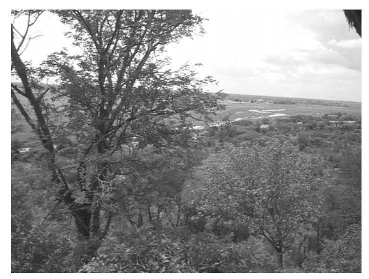
Chobe Enclave Conservation Trust was the first CBNRM project to be developed in Botswana with USAID assistance. The Trust's objectives are to sustainably use, protect and manage the natural resources of the Chobe enclave for the benefit and development of the local communities.

As in other parts of Africa, the support of foreign donors and NGOs to CBNRM projects has been critical. The time from initially organizing to obtaining a lease from the Land Board averages three years. Donors and NGOs are the only source of financial and technical assistance for communities during this period. In general, indigenous governmental and NGOs lack the capacity to provide adequate technical support to CBOs, even after they have obtained their leases. However, promising attempts have been made in strengthening government units and NGOs to provide support to CBOs after foreign assistance ceases. One step in this direction has been the formation of the Botswana Community Based Organisation Network (BOCOBONET), which provides a forum for CBOs and others to meet and share information, experience, and expertise (Rozemeijer 1999). BOCOBONET also offers training in capacity building for CBOs throughout Botswana.