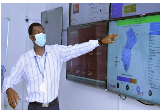
EOC UPGRADES: Scene from a virtual tour of the USAID-upgraded Emergency Operations Center in Cross River State on June 16, 2020.

In June and July, U.S. officials joined officials from nine Nigerian states to virtually