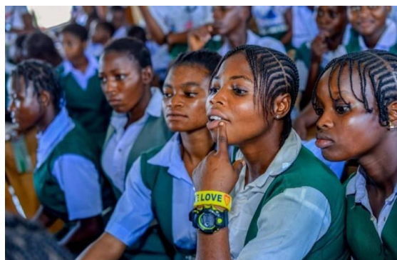
YOUTH HUBS: A new USAID activity will establish and strengthen a network of ‘youth hubs’ in Nigeria’s two largest cities in support of two million adolescents.

information for workforce development, and activities that encourage self-esteem and team building. By establishing and strengthening a series of interconnected “youth hubs” in the two megacities, the activity will empower 15-to 19-year-olds with health and life skills, reproductive health awareness, access to reproductive health, and improvement of gender equality. In the teen-friendly context of sports, arts, and other group-centered