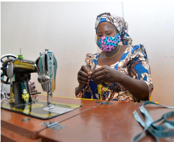
50,000 MASKS: With support from USAID, 200 new seamstresses helped protect the public and boost the economy making facemasks.

In conflict-ridden Borno State, USAID trained about 200 women, mostly widowed or otherwise made vulnerable by the Boko Haram insurgency, on sewing and tailoring skills to produce more than 50,000 facemasks to help protect the Northeast from the COVID-19 pandemic. Once trained, these women were able to produce about 60 masks a day fabricated from Ankara, a traditional cloth. The effort boosted local production and promoting