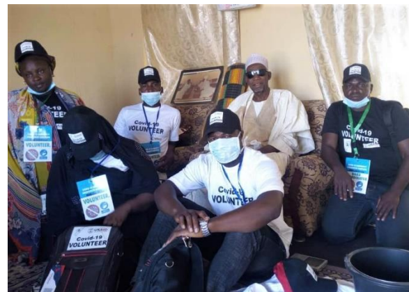
MILLION MESSAGES: USAID has teamed up with comms giant Airtel to deploy both IVR and SMS platforms to deliver key messages to contain the spread of COVID-19.

USAID assisted the Nigerian government to develop critical messages on COVID-19