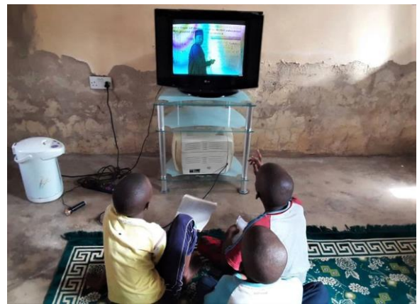
LOCKDOWN LEARNING: Family members in Bauchi take in online learning under an agreement with state education officials and UNICEF supported by USAID.

To help keep students learning during the COVID-19-induced break from classes,