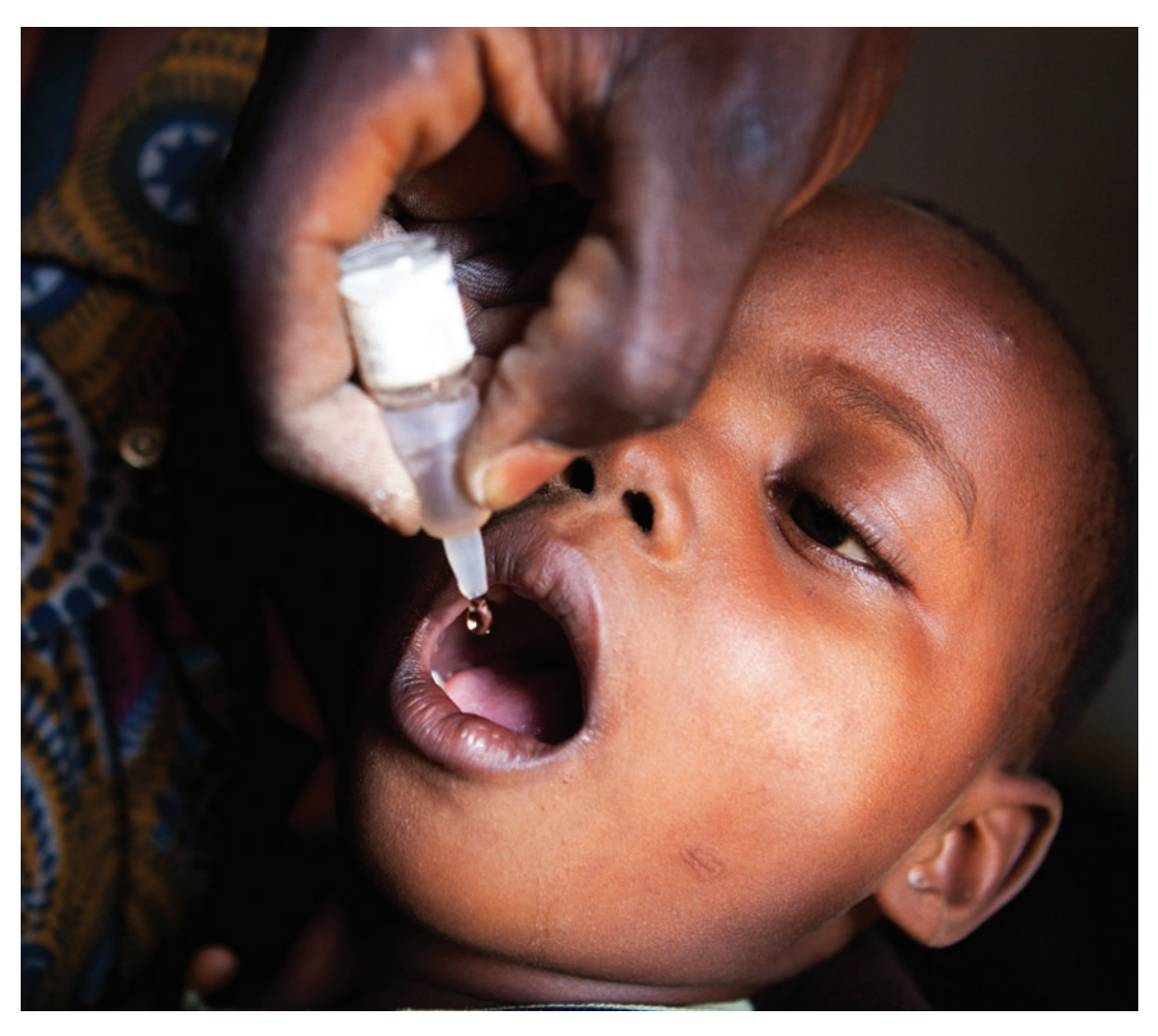
A Democratic Republic of the Congo (DRC) Ministry of Health employee (right) administers a polio vaccination to a Congolese child during the first day of a national polio mass immunization campaign in Lubumbashi on October 28, 2010. Fifteen African countries held similar campaigns for 72 million children.

made and how they made them—that they need to share with other teams around the world. GHI can provide technical assistance to transfer the evidence-based strategy. Such an initiative should address the following issues: