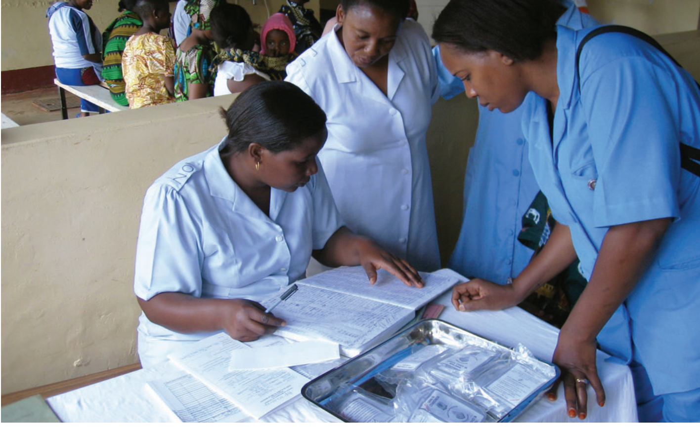
Health workers review logs at a clinic's registration table in the Morogoro Region of Tanzania, where patients receive treatment for malaria.

reflect a careful analysis of how to best achieve the desired outcome. Administrative and clinical processes come together when a provider sees a patient. If the provider has the knowledge, skills, and motivation to follow the guideline, has the medical record at hand, and has the needed drugs and equipment, it is because numerous processes have succeeded. But how effective are these diverse processes in the health systems that GHI seeks to strengthen? How can they be improved?