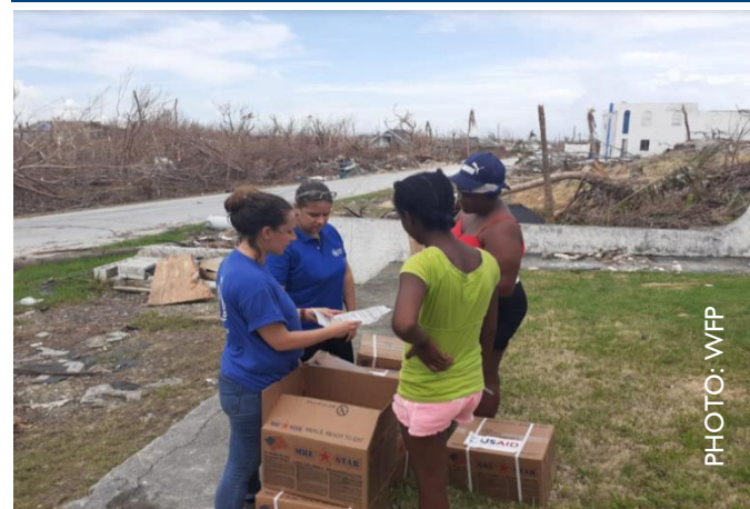
Photo: WFP staff in The Bahamas assist with the distribution of FFP-supported ready-to-eat meals.