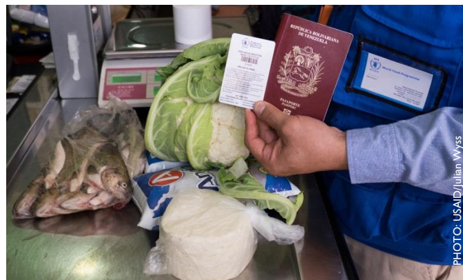
Photo: Venezuelans use a WFP-issued food voucher to purchase nutritious, locally grown foods at a market in Imbabura Province’s Ibarra City.