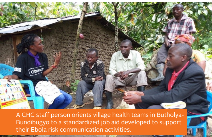
A CHC staff person orients village health teams in Butholya-Bundibugyo to a standardized job aid developed to support their Ebola risk communication activities.

Religious and traditional leaders were engaged through breakfast meetings, radio talk shows, and joint implementation of activities to use their influence to encourage individuals and communities to adopt healthier behaviors. An easy-to-use handbook enabled religious and cultural leaders to link key health messages to specific verses of the Bible and Quran. CHC also worked with the Busoga and Buganda kingdoms to integrate HIV and sexual reproductive health discussions into traditional ceremonies and structures that support adolescents as they transition to young adulthood.