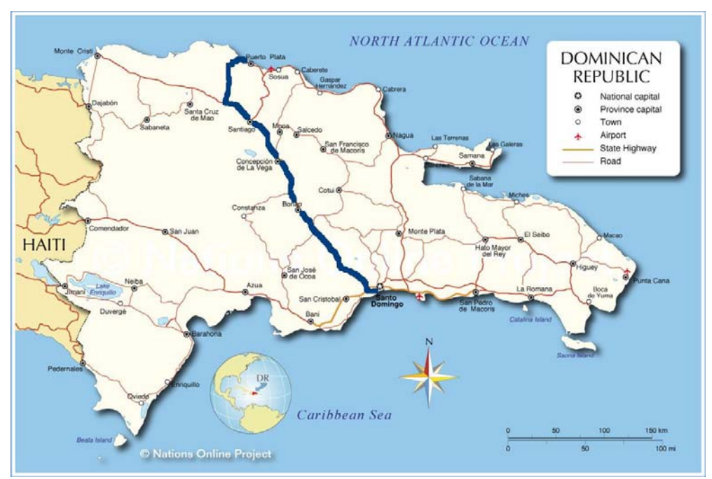
Bold line traces corridor

While most DO1 and 2 resources will be concentrated in this geographic area, it will not be exclusive. In certain cases, such as working in coastal cities on global climate change, some activities will be funded outside of this geographic area. For HIV/AIDS (DO3) the location of key populations will guide where HIV/AIDS investments and services are offered. As mentioned above, some of these key populations (at-risk youth and drug users) may be concentrated in this same urban corridor, but other key populations (people crossing the border and sex workers in tourist areas) are not. Therefore, while DO3 will have significant overlap with DOs 1 and 2 along the Santo Domingo-Puerto Plata corridor, DO3 will not be geographically concentrated.