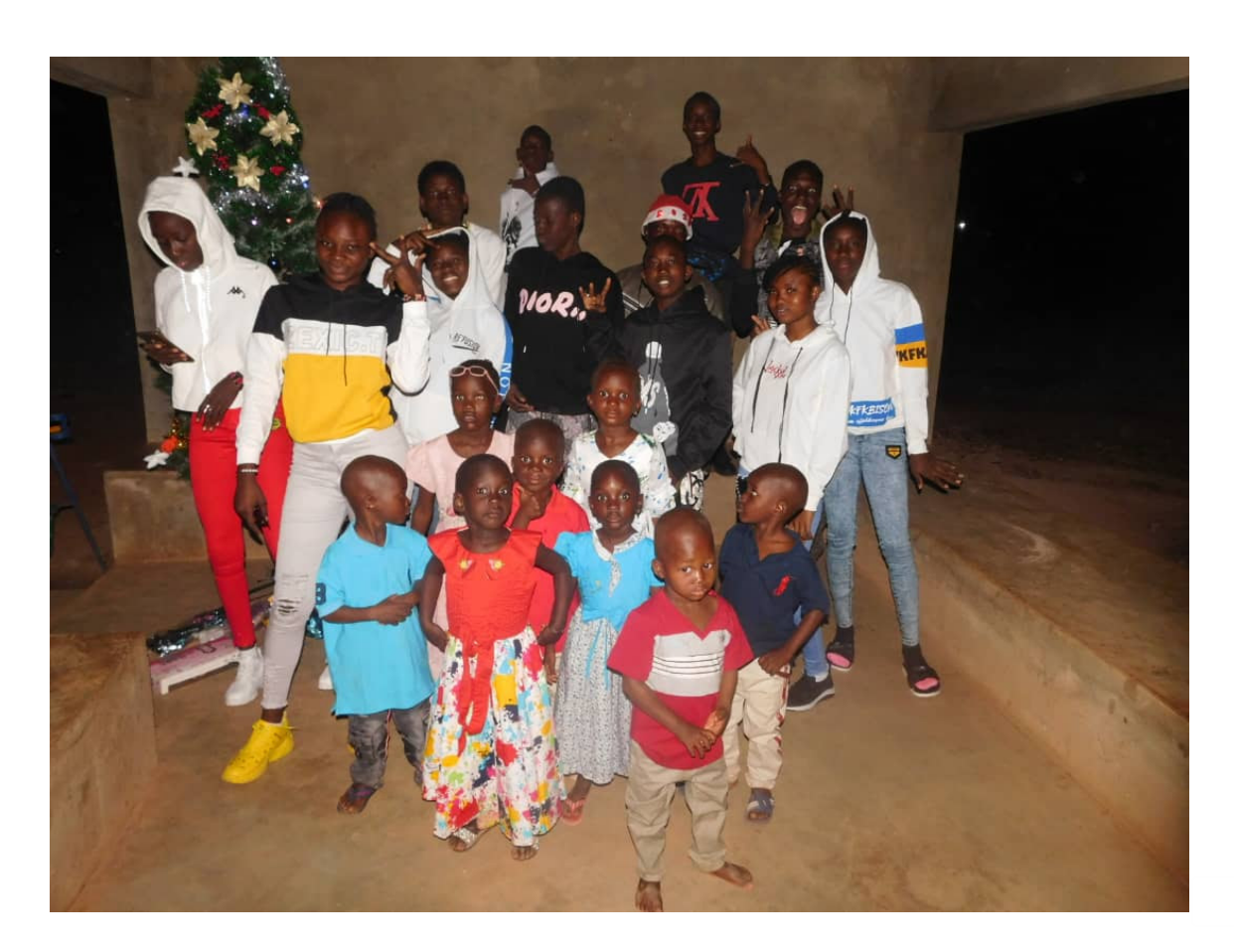
ACFA children at Christmas