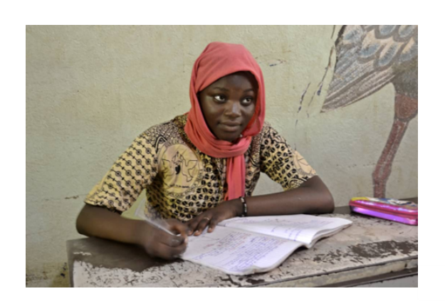
ACFA resident does her homework