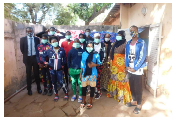
ACFA staff members and students