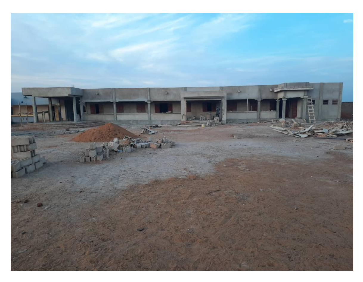
Once completed, this school building will house 12 classrooms. Funding for 6 classrooms has been secured. In the meantime, AFCA is working on finding funds for the remaining classrooms. The recent ASHA award will fund the purchase of books, computers, shelving, printers, scanners, tables & chairs, office furniture, WiFi access, and solar panels to power the library.