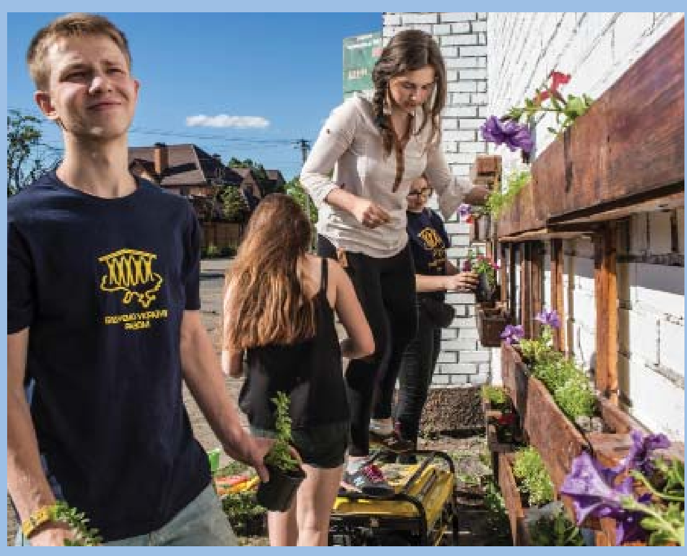
Volunteers beautify public spaces in eastern Ukraine as part of the Build Ukraine Together camp.

SAID provided conflictaffected populations with life-saving assistance in 2017, including food, health care, nutrition, shelter, and other humanitarian needs to vulnerable households in both government-controlled and nongovernment-controlled areas, while also laying a foundation for longerterm recovery. USAID's programs also helped connect areas close to the conflict to the rest of Ukraine, demonstrated the tangible benefits of reform, and provided information that counters malign and divisive narratives in eastern Ukraine.