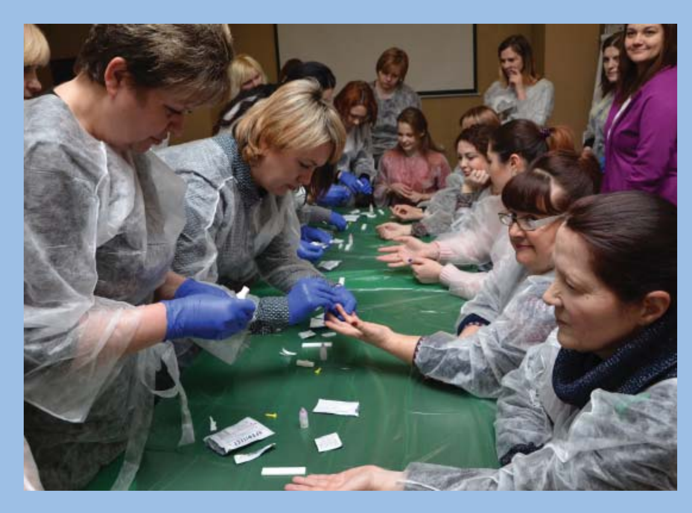
Doctors and nurses training in Odesa to use HIV rapid tests.

n 2017, USAID provided critical support for health reforms that introduce a transparent and efficient health system and better respond to the needs of the Ukrainian people. USAID continued to help Ukraine respond to its high burden of infectious diseases. including HIV/AIDS, viral hepatitis C, and multi-drug resistant tuberculosis (MDR-TB). USAID also worked to counter widespread misinformation about immunization, which has led health providers and parents to downplay its importance and led to a drop in vaccination rates in recent years.