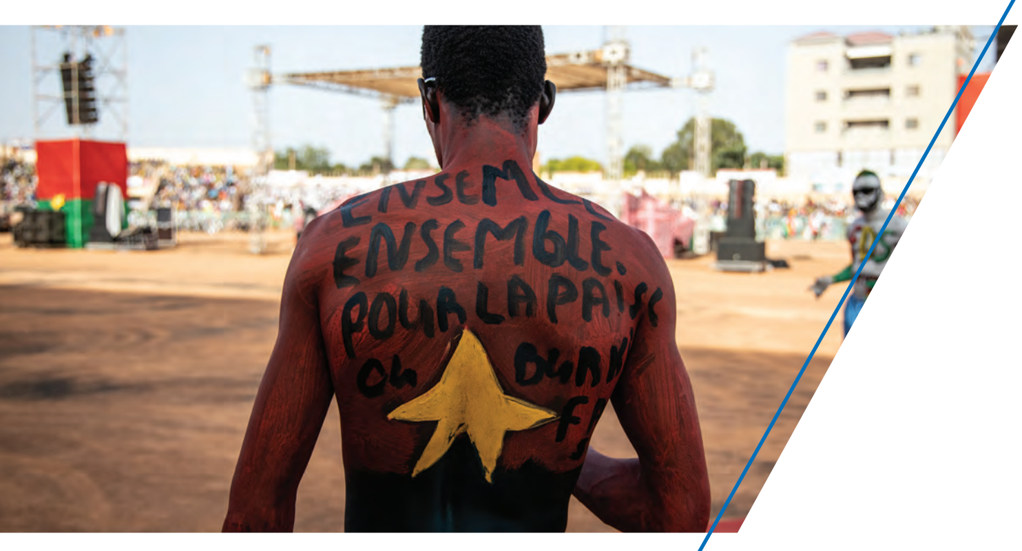
A man stands in a stadium in Ouagadougou where more than 10,000 people gathered to express their support for the defense and security forces of Burkina Faso, who have faced deadly and recurrent attacks from violent extremist groups since 2015.

Ultimately, understanding how actors interact, the roles they play, and the relationships that influence them is key to both effective risk-reduction and sustainable CVE capacity-building.