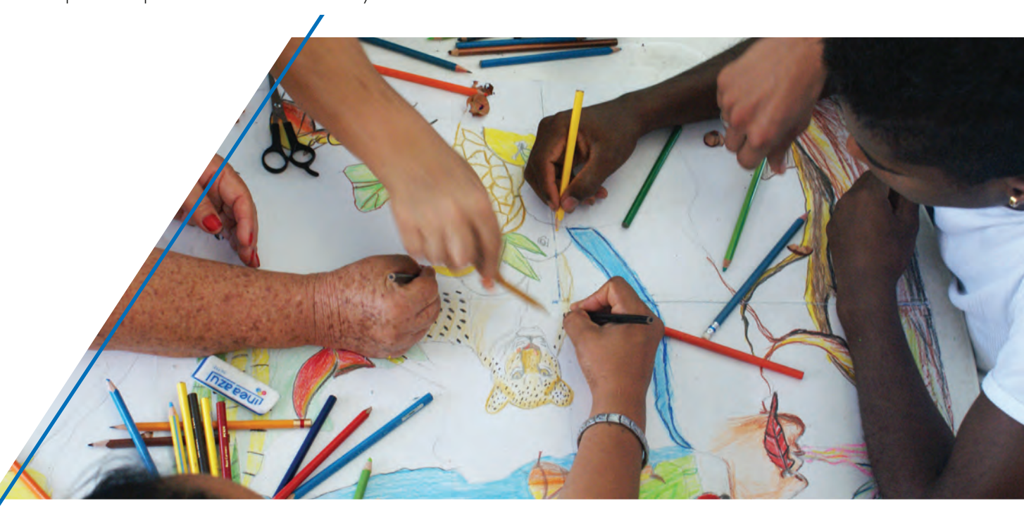
Throughout this Policy we have attempted to illustrate our Agency's CVE work while ensuring we protect our partners and the communities we work with by de-identifying photos, given the very real threat many of our partners face from violent extremists.

USAID is proud to present this new CVE Policy.