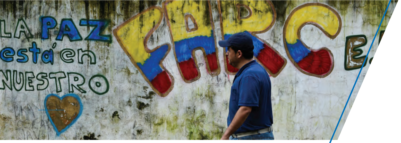
A man walks past graffiti that reads 'Peace is in our heart — FARC EP'. USAID has over three decades of experience in disarmament, demobilization, and reintegration (DDR) activities, working with many partners, to include Colombia, Nigeria, and Sri Lanka.

Effective prevention includes efforts to interrupt and stop violent behavior, in part by helping former violent extremists and affiliates to re-enter society peacefully. As a result, the disengagement and reintegration of former foreign terrorist fighters, their affiliates, and locally-recruited populations constitutes a growing component of USAID's CVE portfolio. While these programs have much in common with their antecedent, the disarmament, demobilization, and reintegration (DDR) of ex-combatants and child soldiers in post-conflict contexts, the complexity of the VEO problem has necessitated innovation and additional rigor related to legal and policy guidelines, eligibility criteria, and operational procedures. Initial programming results also suggest that community preparedness and willingness to receive returnees must be a central component of our reintegration efforts.