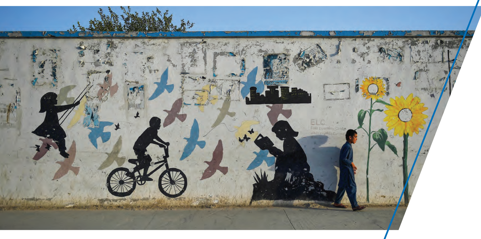
A boy walks by a wall covered with art in Afghanistan toward sunflowers.

This Policy provides the foundation and guidance for USAID's CVE programs. It affirms the importance of targeted and smart investments in development to address this critical challenge to the security and economic prosperity of the United States and its allies. The principles defined herein set the Agency's CVE engagement criteria and demonstrate our resolve to work alongside governments, local communities, civil society, youth organizations, the private sector, women, and leaders of all faiths to build capacity and foster resilience to violent extremist influences.