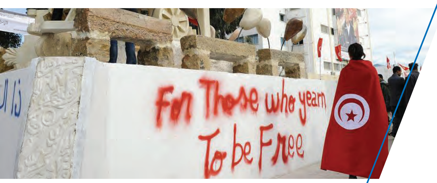
A girl walks past graffiti that reads "For those who yearn to be free" in Tunisia.

Use transnational strategies whenever necessary. While deeply rooted in national dysfunction and state fragility, violent extremism is also a regional and global phenomenon whose effects ripple worldwide through social media's instantaneous delivery of messages, tactics, and ideology. Neighboring states are susceptible to the spillover effects of violent extremism and conflict. In West Africa, for example, violent extremist ideology is a regional threat. To build resistance, USAID helps local communities and their leaders, civil-society organizations, communities of faith, national governments, and regional organizations to build relationships and strengthen coordination while simultaneously targeting at-risk populations at the local level.