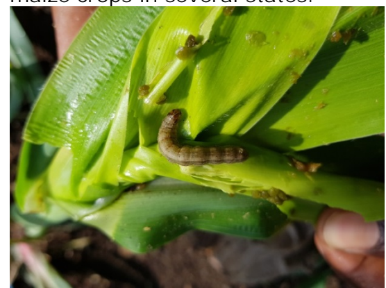
FAW larvae attacking maize plant

rural communities continued through the CBFAMFEW and PHS (IRLCO-CSA, PHS/Tanzania). Control operations were launched by the affected farmers during May (PHS/Tanzania). In Uganda , FAW was reported in western and northeastern parts of the country, including Busoga and Karamoja during May. Late planted maize crops were the most affected during this time. MinAgri is providing technical and material and material assistance to the affected farmers and intensifying information dissemination and training. In Ethiopia , the pest was reported in hundreds of districts in seven administrative regions where thousands of ha of maize crops have been reported affected (PPD/Ethiopia). In South Sudan, the pest was reported affecting maize crops in several states.