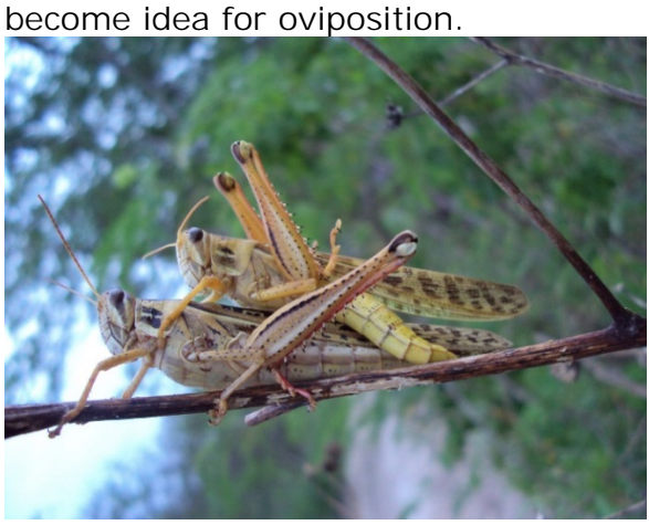
Mating adult CAL in Yucatan, Mexico

Schistocerca piceifrons peceifrons - Central American Locust (SPI): During May SPI is expected to have begun mating following the beginning of the seasonal rains that usually begin in late April into May and cause the soil to