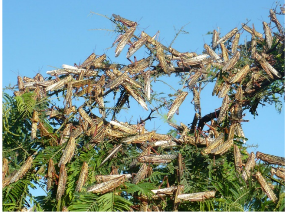
Adult CAL basking in the morning sun in Yucatan Mexico

Forecast: First generation hoppers will begin appearing in the Yucatan Peninsula in Mexico and in León, Nicaragu a during the forecast period and continue developing in the region.