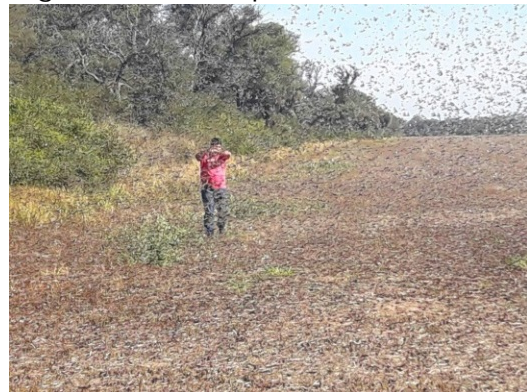
(File photo of SAL swarm in Chaco, Argentina July 2017 (Medina)).

South American Locust, Schistocerca cancellata (SCA): SCA outbreaks are usually reported in Argentina, Bolivia, Paraguay during the summer/warmer seasons. Currently the SCA situation is relatively calm, however, due to a potentially warmer winter season it is likely that locust population will increase during the forecast period.