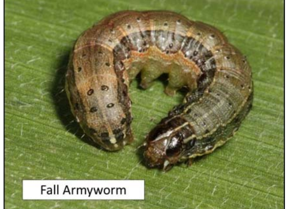
A perfect biometrics image of FAW larva

FAW continued being a problem to maize and other cereal crops in eastern, central and parts of southern Africa. The pest may be present in irrigated crops in other regions as well during this period.