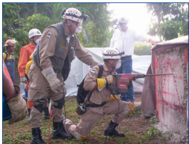
Teams practice penetrating collapsed structures as part of OFDA's Search and Rescue of Collapsed Structures (BREC) course.

Since RDAP's inception in Latin America and the Caribbean countries, in 1989 and 1991 respectively, the OFDA-funded program has trained approximately 40,000 disaster management specialists and certified more than 3,500 instructors across 26 countries. As a result, a significant percentage of