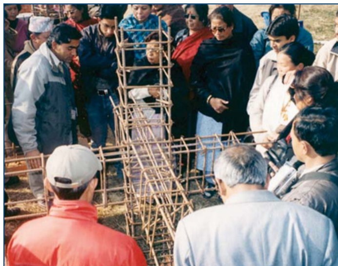
An engineer from NSET explores the common mistakes committed during construction of frame structures in Nepal.

*The funding total above does not include regional or global preparedness activities supported by OFDA's TAG.