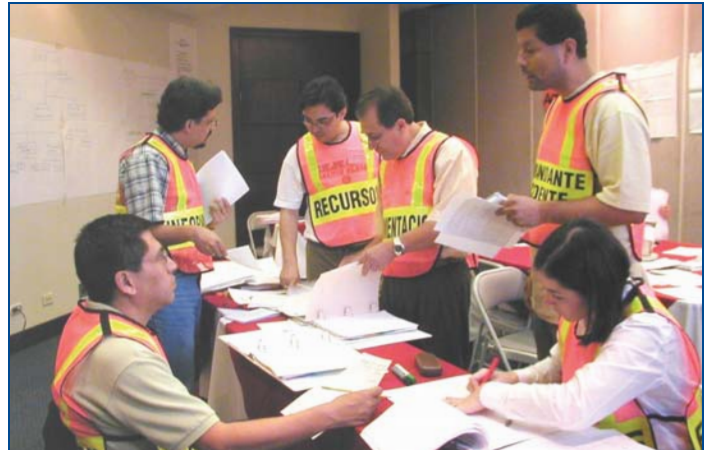
OFDA's network of Latin America-based disaster assistance experts discuss risk management concepts and training methodology as part of the Regional Disaster Assistance Program (RDAP).

A major vehicle for promoting enhanced local preparedness and response capabilities has been the network of Latin America- and Caribbean-based disaster assistance experts prepared for immediate deployment at all times. Over the years, these OFDA consultants have traveled to disaster sites in