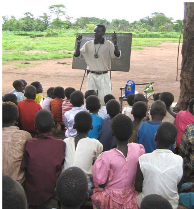
Students in Maridi, Western Equatoria, attend their first day of “radio school.”