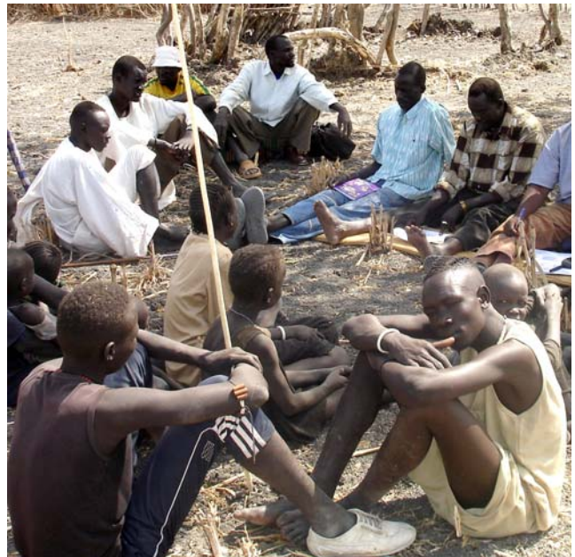
Community meetings are helping to strengthen Southern Sudan's civil society.

Representatives from civil society organizations in Southern Sudan and the Three Areas (Abyei, Blue Nile, and Southern Kordofan) have participated in a series of USAID-supported discussions on ways to work strategically and collaboratively toward the development of Southern Sudan. USAID partners Mercy Corps and IRC facilitate the dialogues, which focus on the role of civil society organizations in post-conflict reconstruction, and which are vital to