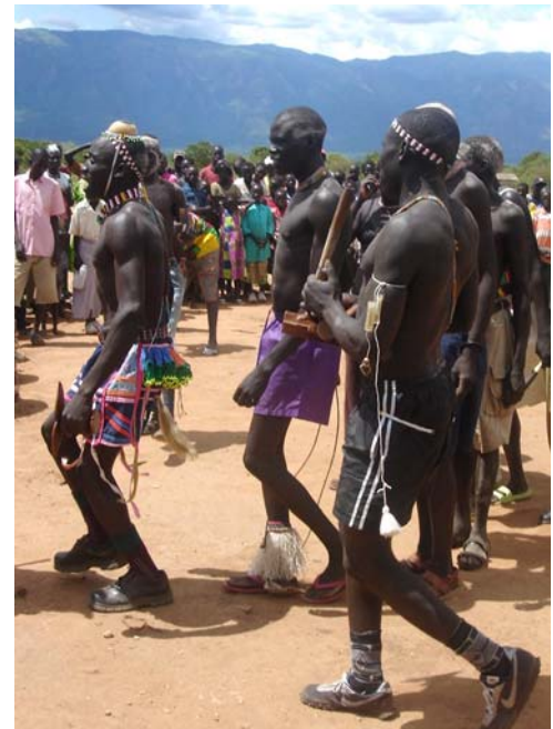
Residents of Kapoeta, Eastern Equatoria do a traditional peace dance at a CPA dissemination rally.

The dissemination process was rolled out in Upper Nile, Jonglei, Warub, and Eastern and Central Equatoria. Official CPA documents in Arabic and English were distributed to all government officials in the south, then a GOSS-approved CPA summary was developed and published in English. (An Arabic version of the summary will be published in June.) At the end of March, the GOSS led a CPA orientation workshop in Juba for 300 government officials to help them gain a better understanding of the CPA and to empower them to raise community awareness. To complement the dissemination process, the Sudan Radio Service created audio versions of the summary in seven languages—Moro, Arabic, simple Arabic, Toposa, Shilluk, Dinka, and Nuer—and the Sudan Mirror published 22,000 CPA summary supplements to be included in its Easter edition.