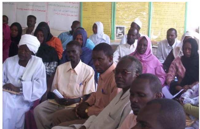
Volunteers attend human rights training in Khartoum (left) and gender education workshops in Darfur (right).

With support from USAID, EI-Madina Center for Gender and Development and the University of Khartoum recently facilitated training sessions that