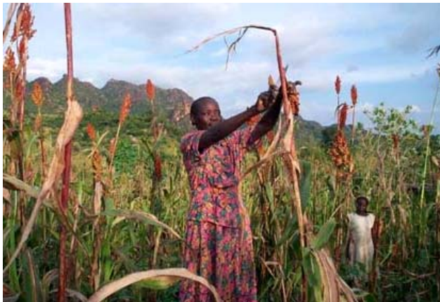
A woman tends her field in Eastern Nagurban in the Nuba Mountains.

household also receives a hoe, panga (a long knife), and sickle. USAID partner Norwegian People's Aid has already distributed 140 tons of seeds to 5,000 families in Jonglei's Ayod, Wuror, Nyirol, and Duk counties. Local residents report that the program is the most significant agricultural assistance to reach many locations in decades.