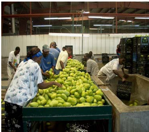
Haitian workers sort washed mangoes for export. Grown exclusively in Haiti, the award-winning Haitian Francique mango has irresistible tropical aroma and sweetness. The primary importer of Francique mangoes is the United States.

USAID and the U.S. Department of Agriculture are supporting mango producers and exporters to improve product quality and the efficiency of pre-export clearance requirements.