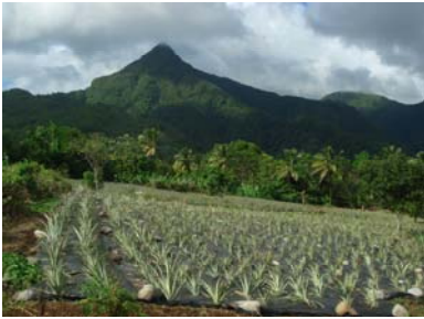
Improving production for export to select markets in Miami under the Caribbean Trade Expansion program (CTEP).