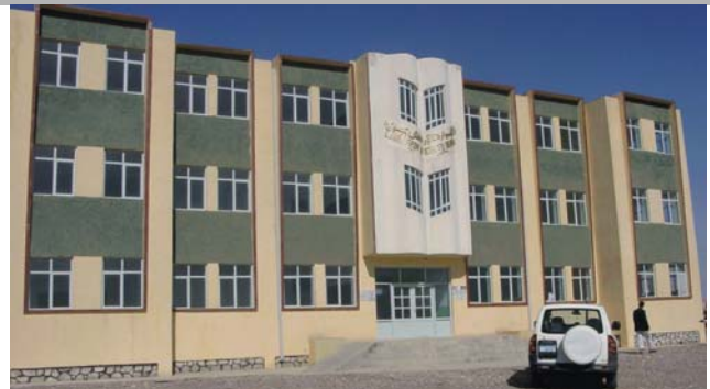
Newly rehabilitated teacher training college in Herat.