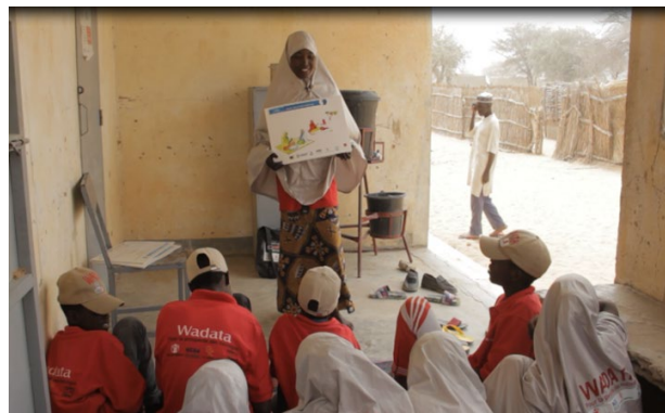
Members of Wadata’s Adolescent Life Skills Education Group meet in Zinder’s Bilmari village.

USAID/BHA delivered more than $10.6 million in FY 2022 support to SCF to continue implementing the Wadata project, a five-year RISE II RFSA program aimed at improving food security in Niger’s Zinder Region. The USAID/BHA partner worked with community groups and local organizations to increase community capacities, food access, and productive assets. Specifically, SCF helped develop entrepreneurial projects and provided life skills and vocational training—including carpentry, knitting, metalworking, motorcycle repair, and sewing—for approximately 7,400 youth participating in grassroots youth groups. To address gender inequality and reduce barriers to economic growth, SCF supported community savings and loan groups, with nearly 8,700 participating women undertaking new livelihood activities to diversify their income during the fiscal year.