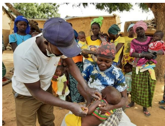
Children are screened for malnutrition in SCF's USAID/BHA-funded Albarka RFSA.

USAID/BHA provided more than $11.5 million in FY 2023 funding to SCF to implement Albarka, a project aimed at stabilizing and strengthening food security and resilience among at-risk communities in central and northern Mali, including those affected by conflict. SCF continued to foster community self-sufficiency during the fiscal year by empowering youth to drive economic and social development, promoting improved agricultural practices, and supporting community-driven approaches to natural resource management. The INGO provided food and nutrition assistance to prevent and treat acute malnutrition and bolstered access to health and WASH services, including access to safe drinking water. Additionally, SCF continued to expand the mother-to-mother approach to promote best practices for infant and young child feeding; more than 1,800 support groups—reaching nearly 27,000 pregnant and lactating women—had been established by mid-FY 2023.