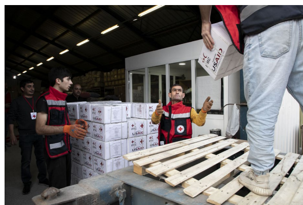
Armenian Red Cross volunteers offloading a truck carrying USAID/BHA-funded kitchen sets, intended to reach 700 displaced households.

With regional funding in FY 2023, USAID/BHA continued support for Catholic Relief Services' (CRS) efforts to bolster the resilience of communities in Europe against recurrent natural disasters, including drought and floods. The Project for Increasing Resilience to Natural Disasters and Enhancing Preparedness Strategy (PREPS) reached an estimated 3,100 people, including nearly 280 internally displaced persons, across Bosnia and Herzegovina and Serbia during the fiscal year with activities to strengthen disaster preparedness. In addition, PREPS supported communities and municipalities to collaborate on disaster management initiatives—including the development of preparedness plans—that increased resilience at the community, household, and municipal levels.